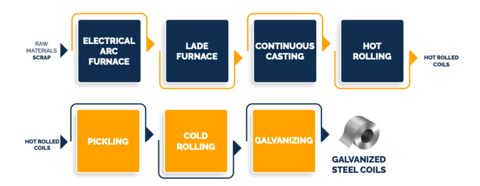
Figure 2: Galvanizing process.